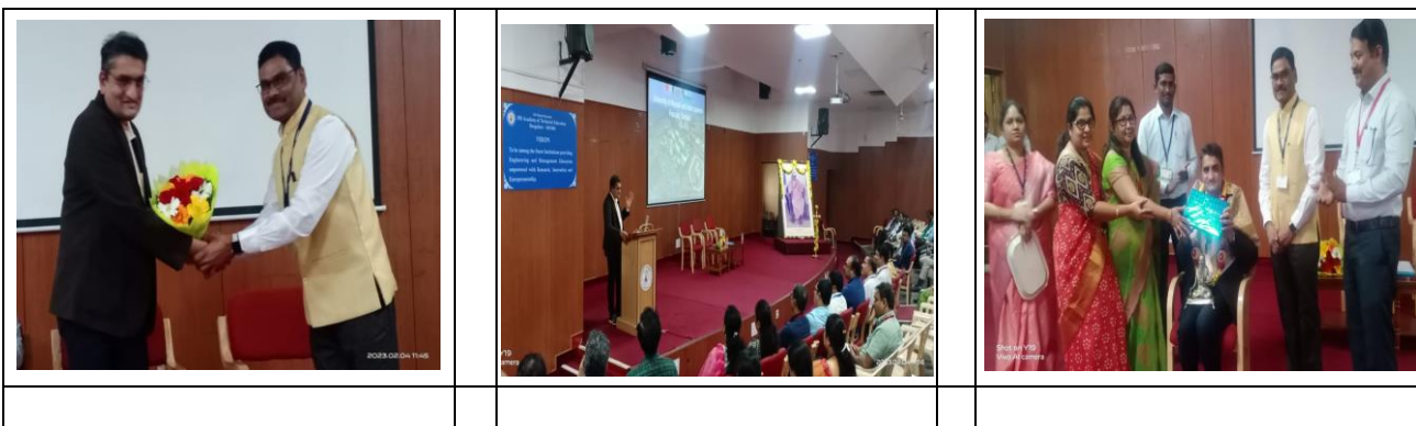
Student Development program on “Skill and Upskilling” on 24 th June 2022 and industrial visit from 27 th June to 6 th July 2022.