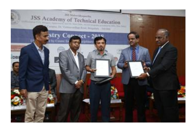
MoU Exchange with AMASL