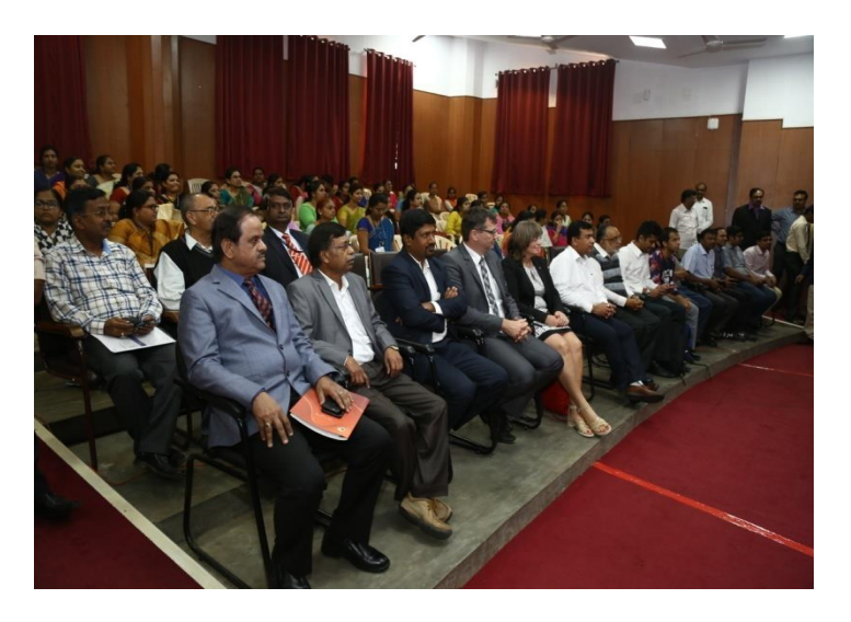
Industry Connect 2018