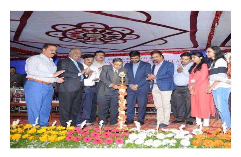
Figure 2. Lighting the lamp