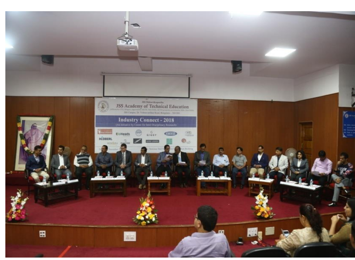
Industry Connect 2018 Inaugural