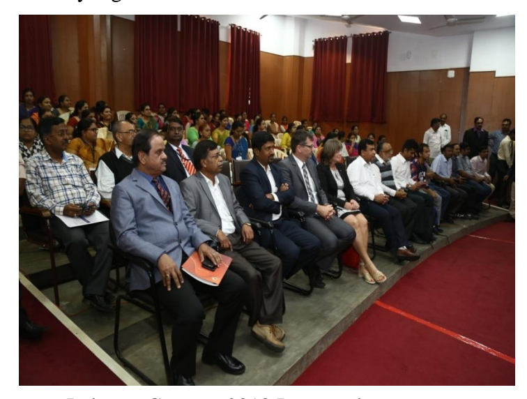
Industry Connect 2018 Inaugural