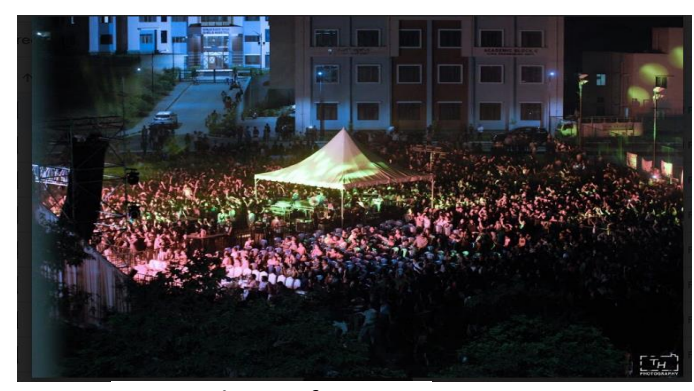
Students of JSSATEB