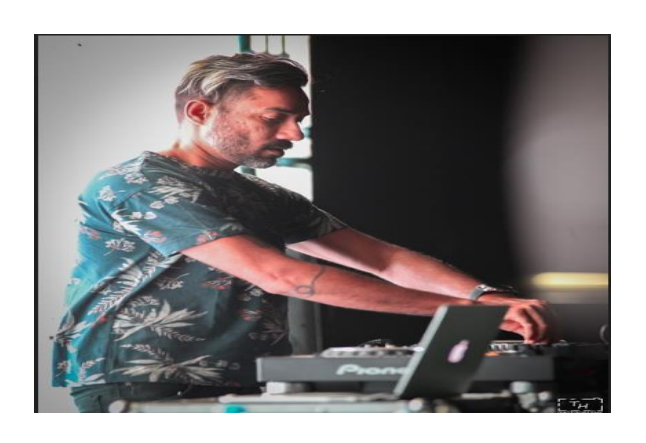
Nucleya. DJ Singer