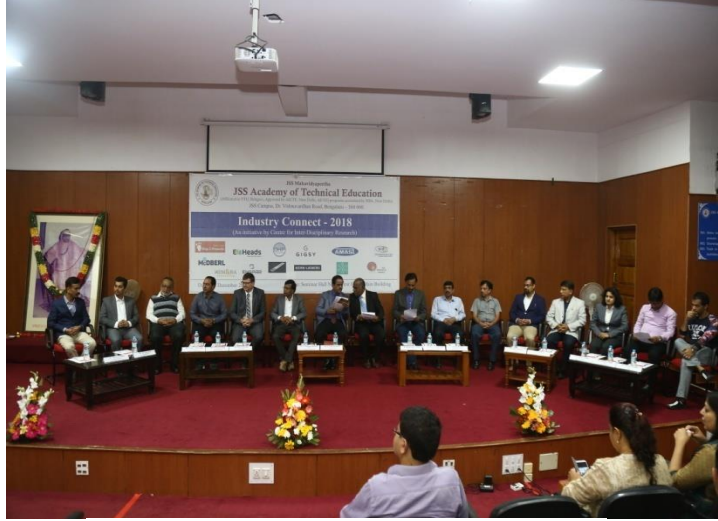
Company representatives on the dais