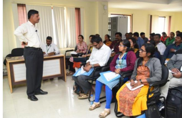
Five days FDP inauguration function