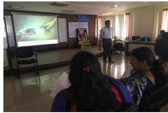
Expert talk by Harman Technologies