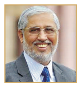
Anil D Sahasrabudhe Chairman, AICTE

I am very happy to see that the detailed guidelines have been issued by Ministry of Human Resource Development on National Innovation and Startup Policy for students and faculties of higher education institutions which further strengthens the Startup Policy released by All India Council of Technical Education in November 2016 from Rashtrapati Bhawan, just after few months of Startup action plan announced by the Government of India in January 2016.